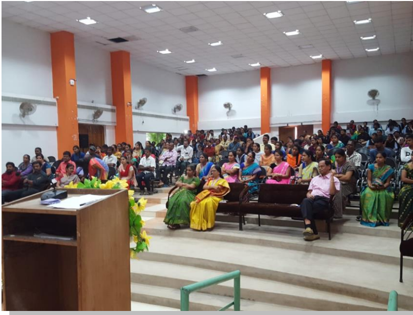
Students and faculty members gathered at orientation program